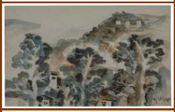
Information Courtesy: Dr. Aditi Nag Cha