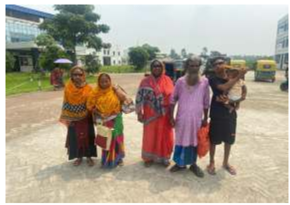
Happy family. But follow up is necessary according to the doctors.