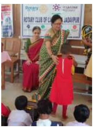
School bag distribution to small children of Sihas village

Donation of three Air Conditioners for the rare book section of Rammohan Library